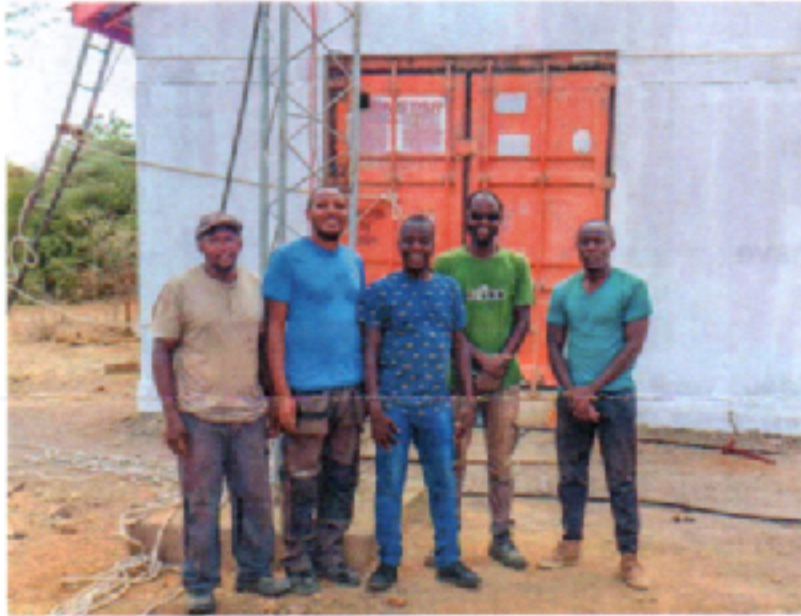
The Kapoeta installation team

Thank you for your partnership with us in the Great Commission. A gift in August is worth double the $725.00 towards the Wyatt Support Fund here at Galcom, not because of any fancy matching-funds challenge, but simply because giving drops so low this month that every gift means so much more! God bless you for standing with us during the summer months.