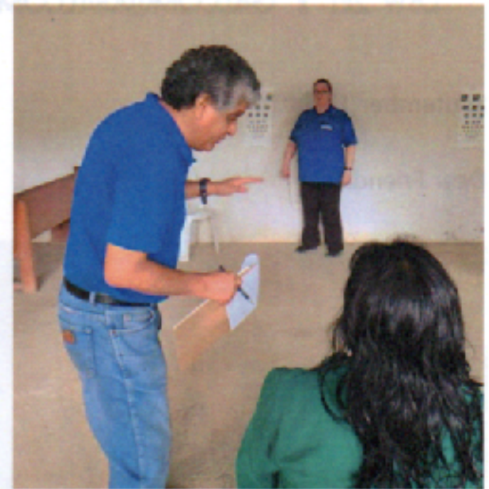
Eye-glass clinic in Peru